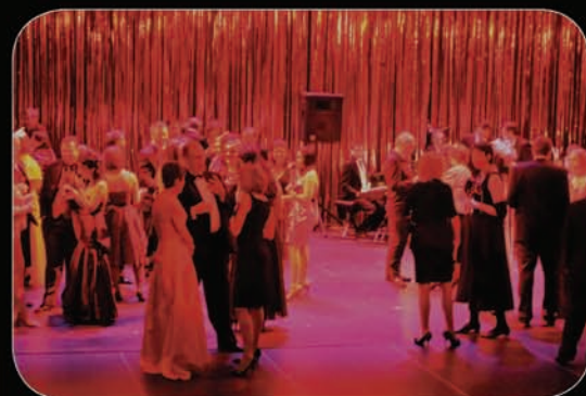
Guests enjoyed mingling and dancing on the stage following the award ceremony.