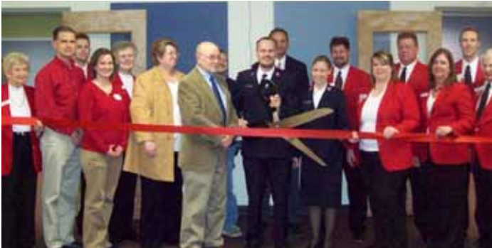
Salvation Army February 23, 2010