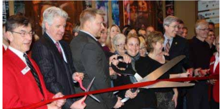
Theatre Cedar Rapids Reopening February 26, 2010