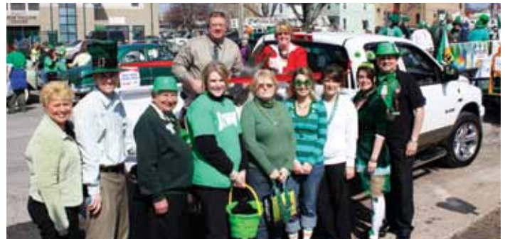
Chamber Ambassadors represented The Chamber by participating in the 2010 SaPaDaPaSo Parade, March 17, 2010