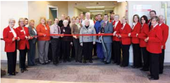
Mercy Medical Center - Katz Lung Center February 24, 2010